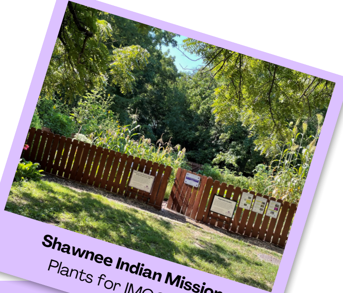
Shawnee Indian Mission Plants for IMGCC Tour