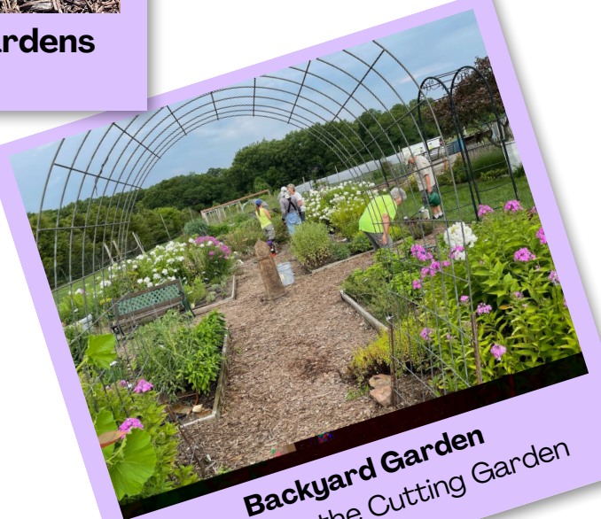
Backyard Garden Expanding the Cutting Garden