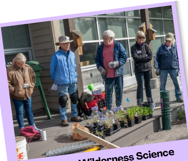
Blue Valley Wilderness Science Planting Native Plants