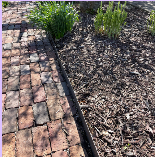
Shawnee Town Gardens Metal Edging