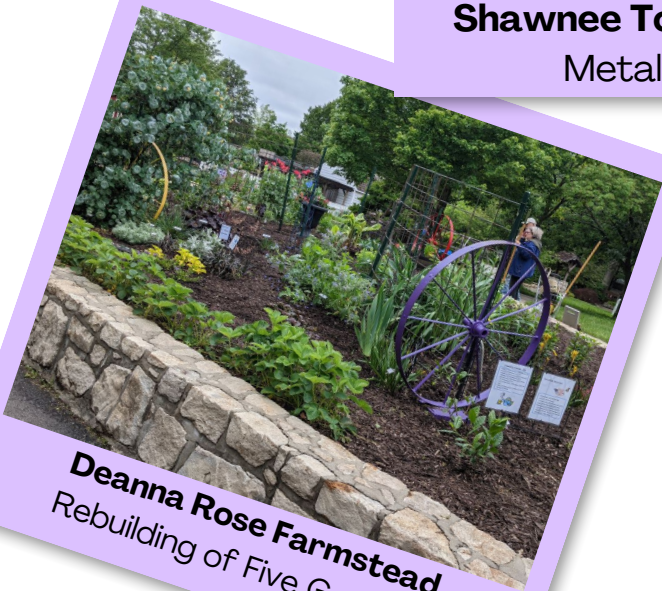
Deanna Rose Farmstead Rebuilding of Five Gardens