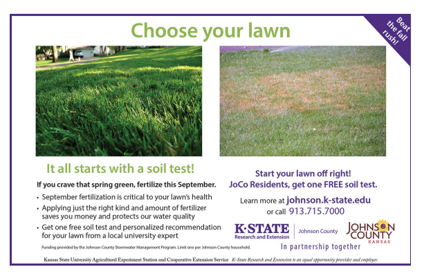
Water quality ad, JoCo Mag Summer 2018

S tormwater runoff is a leading contributor to contaminants in our county's streams and lakes. Johnson County Extension works with Johnson County Government and local cities and businesses to educate the public through a strategic marketing campaign on ways residents can help reduce nonpoint sources of contaminants during stormwater runoff.