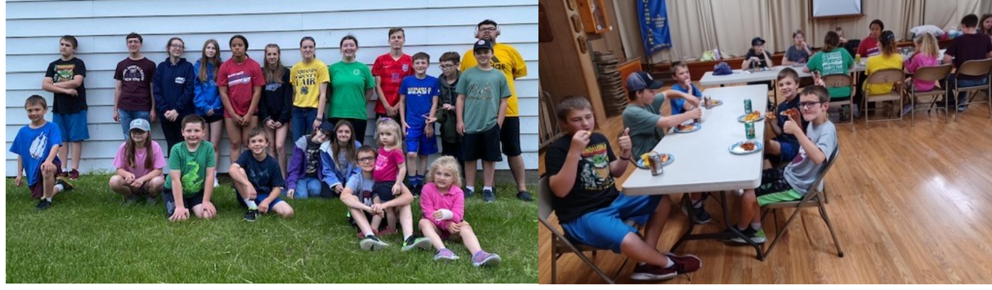
22 Prairie Moon 4-H members rang in the unofficial start of summer with a lock-in.

What do a game of spoons, pizza, s'mores, Uno, Monopoly, Twister, horseshoes, ladder toss, cornhole, and bubbles all have in common? If you guessed an electronics-free night you guessed correctly. If you guessed a 4-H lock-in at the Morning Grange building to celebrate the end of the school year, then you also guessed correctly. Recently 22 members of the Prairie Moon 4-H Club shared an all-nighter to ring in the beginning of summer, old school style. While not all participants lasted without catching a few zzzzzz's, many did, and all without the aid of any electronic devices. It was an exciting way to get the much-needed season of relaxation underway.