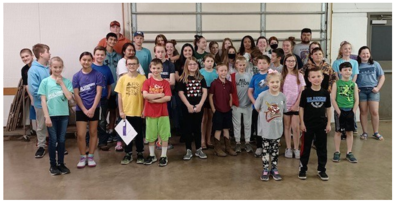
Members of the Prairie Moon and the Prairie Star 4-H Clubs Unite for Johnson County

Recently the Prairie Moon 4-H Club from Spring Hill combined forces with the Gardner-based Prairie Star 4-H Club for the betterment of Southern Johnson County. They held their monthly meetings in tandem while strategizing about how they could collaborate on an "in town" gardening project based on the Johnson County Fair Grounds. Both clubs also presented project talks in preparation for the upcoming Johnson County Fair. The fair will be held at the Johnson County Fair Grounds in Gardner from July 31 through August 6, 2022. Members from both the Prairie Moon and the Prairie Star 4-H Clubs look forward to sharing our projects with you there.