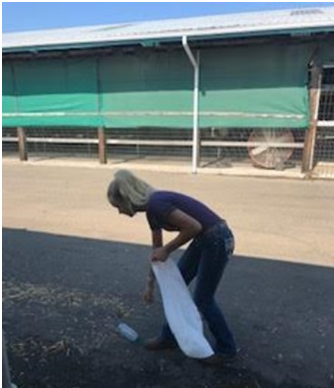
Kylie picking up a water bottle.

Prairie Moon and other clubs have the opportunity to clean up the fairgrounds. They pick up trash and clean their assigned section of the fairgrounds. It is a good time to make the fair shine. We are proud of another successful fair!