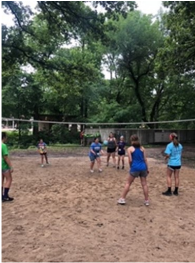
4-H campers playing volleyball.

Rock Springs Fantastic 4-H Camp is a wonderful place to get to know nature and the people around you. Rock Springs protects the wildlife and you. If you love camping, horses, art, shooting sports, the pool, and leadership you will love it as much as I do. I recently went to Rock Springs for Fantastic 4-H Camp and loved it! It was really fun getting to know people from all different counties and become friends with them. We have a large attendance of Prairie Moon 4-H members. They all loved the experience. 4-H members can't wait to go back next year!