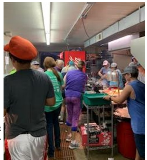
Prairie Moon working at the food stand.

Prairie Moon 4-H Club worked the food stand at fair Saturday evening. It was a lot of fun, and involved a lot of team work and patience. Prairie Moon had two different shifts, and worked for 6 hours. They can't wait for fair next year!