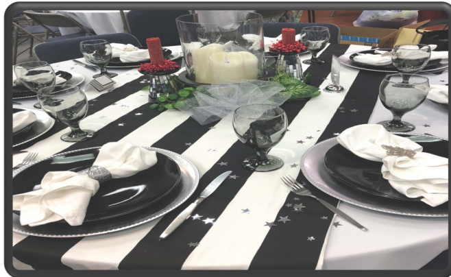
Table Designers Needed for 12 Tables

Volunteer designers will have the opportunity to display their creativity with color and design by providing décor for their individual tables. You may make this a team project or do this on your own. So use your imagination and get those creative juices going – this will be a great time for all! Table centerpieces will be auctioned off during the live auction. And, to add to the excitement – prizes for the top three decorated tables!