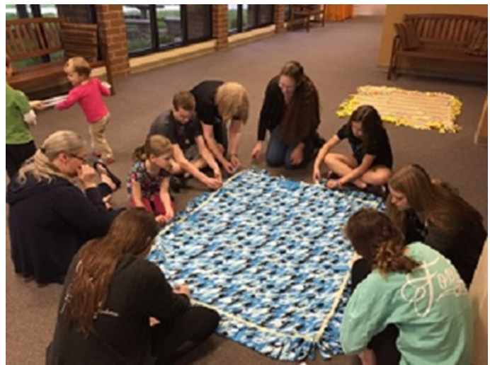
Members tying knots on fleece blankets to donate to a local children's psychiatric hospital/school.