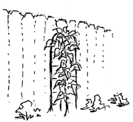
Vine crop on a trellis

Be innovative. To conserve space, think "up." What can you grow on a fence, trellis or arbor?