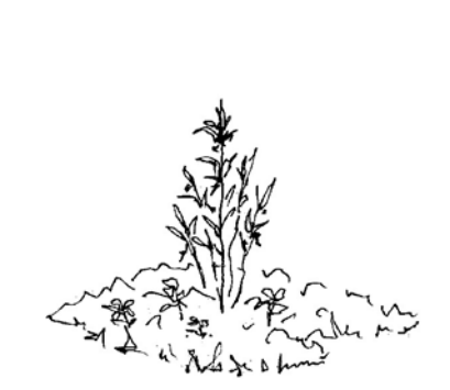
Okra in the center of an island bed

Look over your landscape for possible areas and evaluate their suitability for growing vegetables. Envision the sight of brightly colored greens such as lettuce or spinach tucked in between your shrubs or blooming okra plants in the center or back of a flowerbed. Use your imagination.