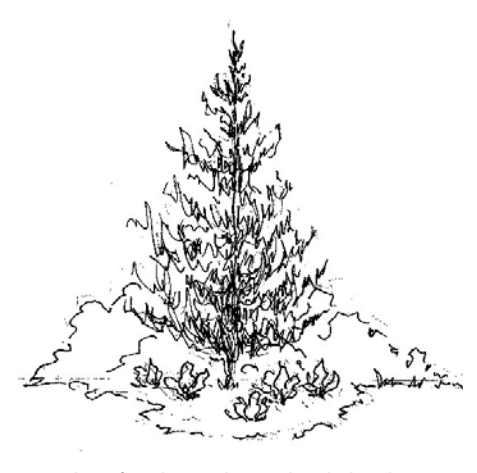
Leafy plants in a shrub bed